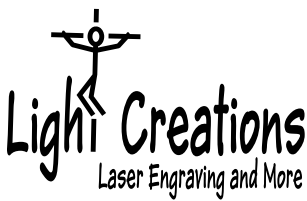
Photo Engraving Information Form

Light Creations 206 Augusta Court Bristol, VA 24202